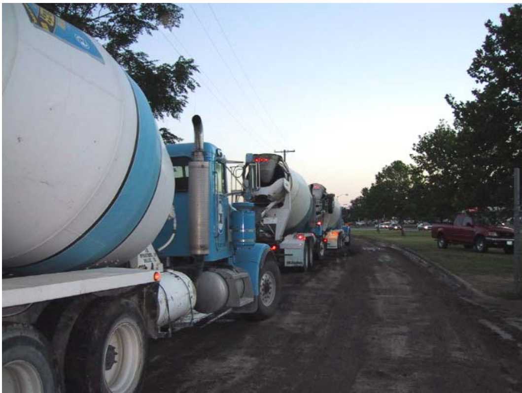
Lined up for early morning concrete pour