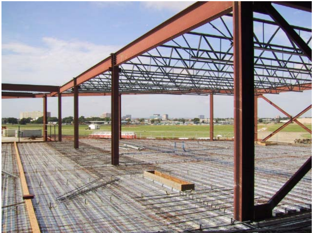
2 nd floor ready for concrete pour