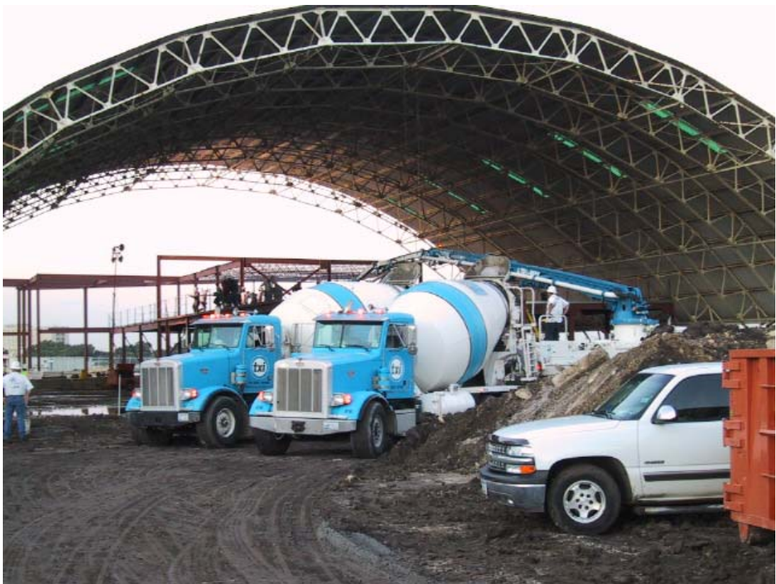
Pumping concrete for 2 nd floor pour