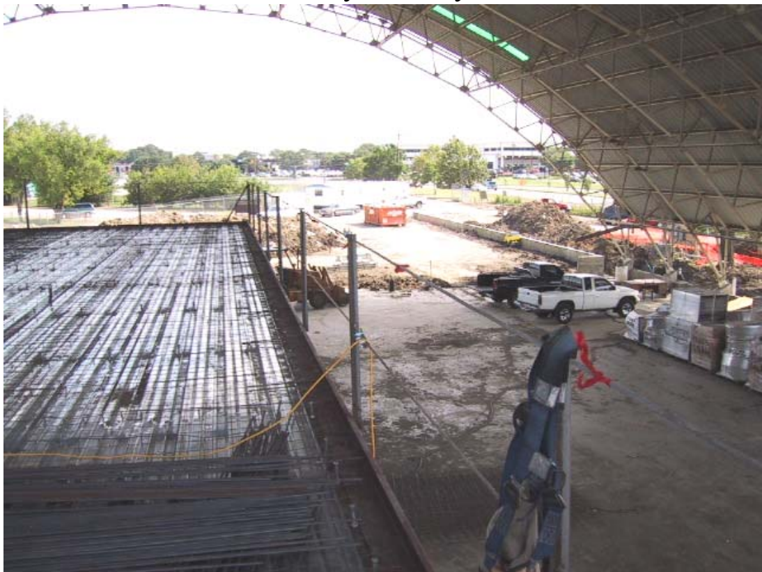
View from auditorium balcony down to education center area