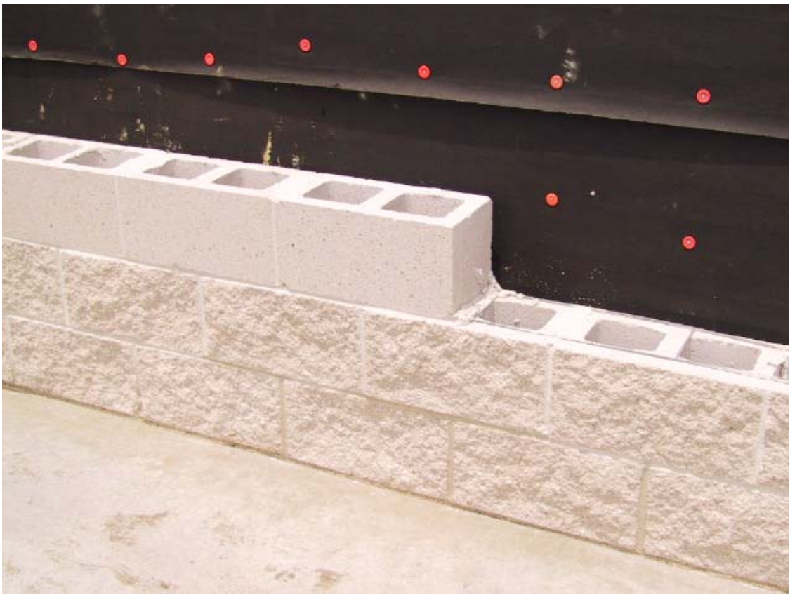
Outside masonry brick style and color